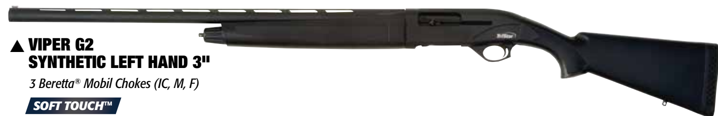
▲ VIPER G2 SYNTHETIC LEFT HAND 3" 3 Beretta® Mobil Chokes (IC, M, F) SOFT TOUCH™

The Viper G2 Left Handed models offer the same great features in a left-handed version. The reliable G2 comes complete with a fiber optic front sight, Soft Touch™ and 3 Beretta® Mobil Choke Tubes (IC, M, F).