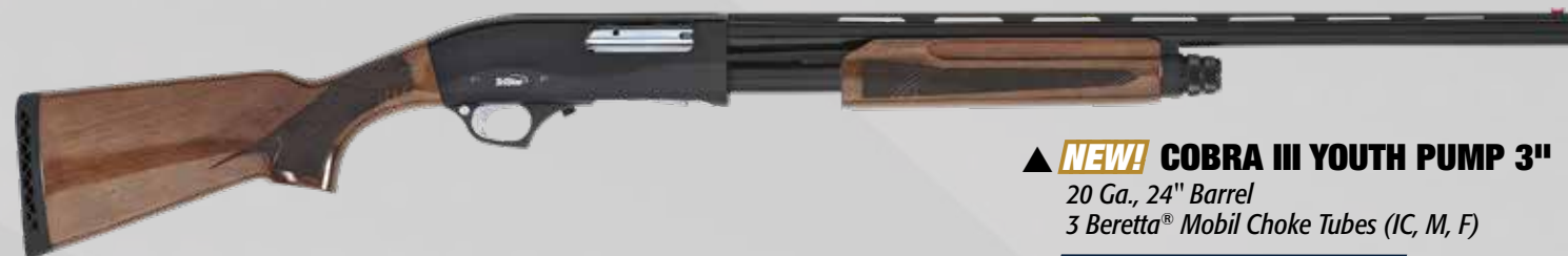
▲ NEW! COBRA III YOUTH PUMP 3" 20 Ga., 24" Barrel 3 Beretta® Mobil Choke Tubes (IC, M, F) CAMO MODELS AVAILABLE