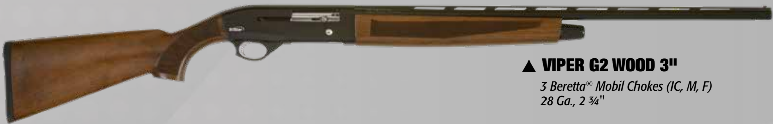
▲ VIPER G2 WOOD 3" 3 Beretta® Mobil Chokes (IC, M, F) 28 Ga., 2 ¾"