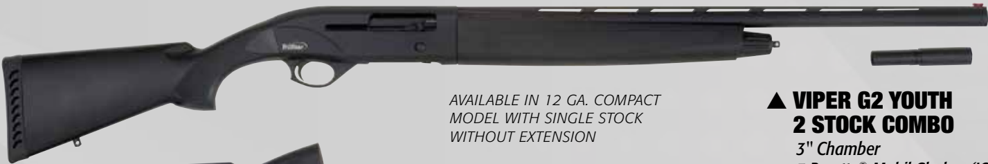
AVAILABLE IN 12 GA. COMPACT MODEL WITH SINGLE STOCK WITHOUT EXTENSION

The Viper G2 Youth is perfect for growing kids or smaller statured shooters. Comes with 3 Beretta® Mobil Choke Tubes (IC, M, F).