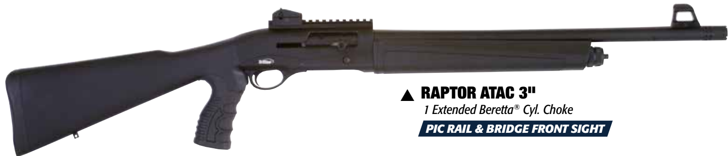
▲ RAPTOR ATAC 3" 1 Extended Beretta® Cyl. Choke PIC RAIL & BRIDGE FRONT SIGHT