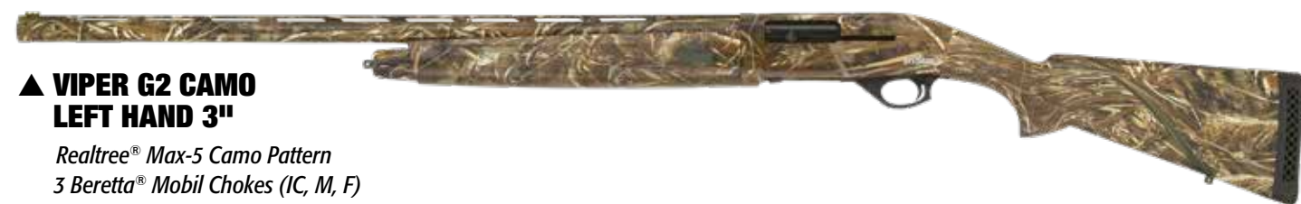
▲ VIPER G2 CAMO LEFT HAND 3" Realtree® Max-5 Camo Pattern 3 Beretta® Mobil Chokes (IC, M, F) SOFT TOUCH™