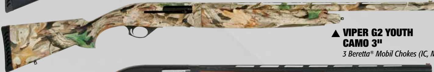
▲ VIPER G2 YOUTH CAMO 3" 3 Beretta® Mobil Chokes (IC, M, F)