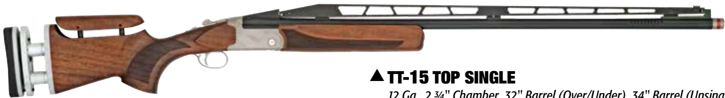
▲ TT-15 TOP SINGLE 12 Ga., 2 ¾" Chamber, 32" Barrel (Over/Under), 34" Barrel (Unsingle) 3 Beretta® Mobil Extended Color-coded Choke Tubes (M, IM, F) ADJUSTABLE RIB + COMB + BUTT PAD

All trap models come with Tristar's Exclusive TT-15 3-Year Warranty.