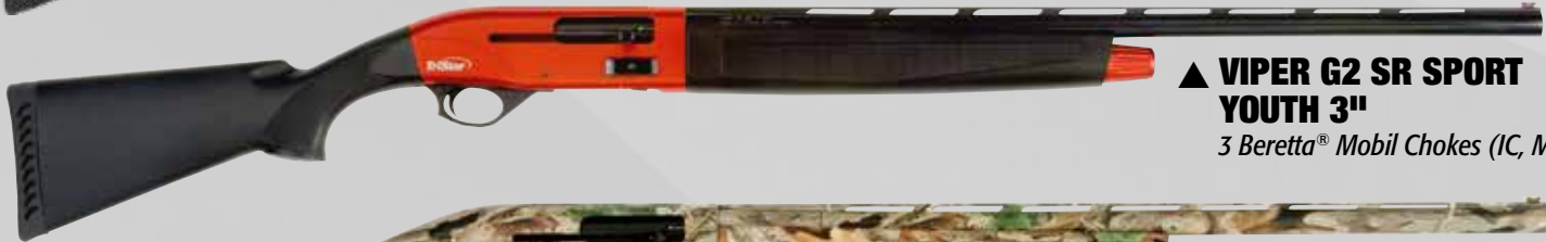
▲ VIPER G2 SR SPORT YOUTH 3" 3 Beretta® Mobil Chokes (IC, M, F)