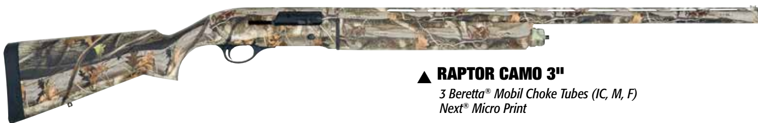
▲ RAPTOR CAMO 3" 3 Beretta® Mobil Choke Tubes (IC, M, F) Next® Micro Print