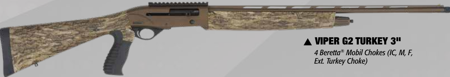
▲ VIPER G2 TURKEY 3" 4 Beretta® Mobil Chokes (IC, M, F, Ext. Turkey Choke)