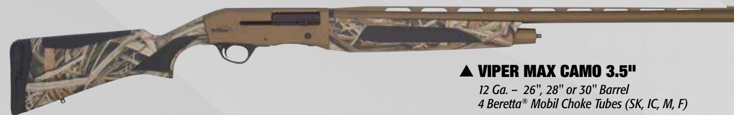
▲ VIPER MAX CAMO 3.5" 12 Ga. – 26", 28" or 30" Barrel 4 Beretta® Mobil Choke Tubes (SK, IC, M, F) OVERMOLDED RUBBER GRIPS