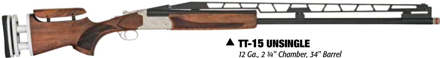
▲ TT-15 UNSINGLE 12 Ga., 2 ¾" Chamber, 34" Barrel 3 Beretta® Mobil Extended Color-coded Choke Tubes (M, IM, F) ADJUSTABLE RIB + COMB + BUTT PAD