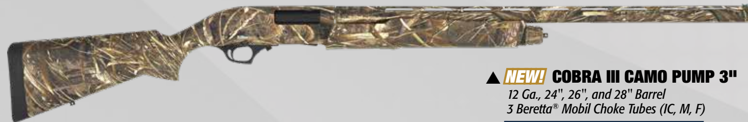
▲ NEW! COBRA III CAMO PUMP 3" 12 Ga., 24", 26", and 28" Barrel 3 Beretta® Mobil Choke Tubes (IC, M, F) AVAILABLE IN BLACK SYNTHETIC