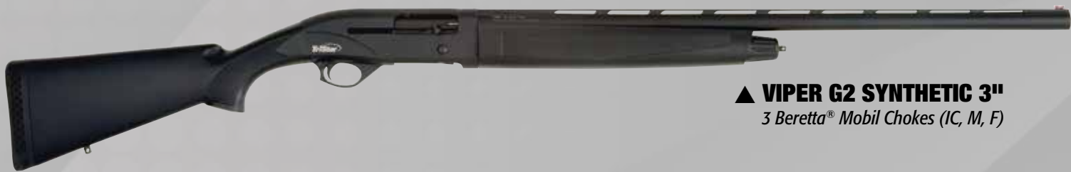
▲ VIPER G2 SYNTHETIC 3" 3 Beretta® Mobil Chokes (IC, M, F)