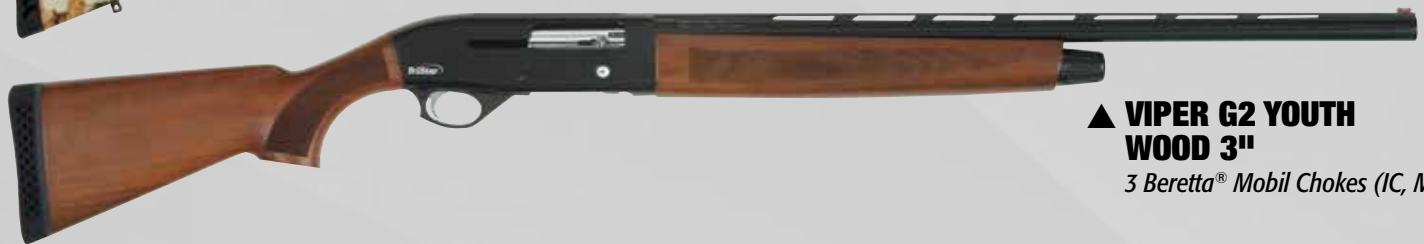
▲ VIPER G2 YOUTH WOOD 3" 3 Beretta® Mobil Chokes (IC, M, F)