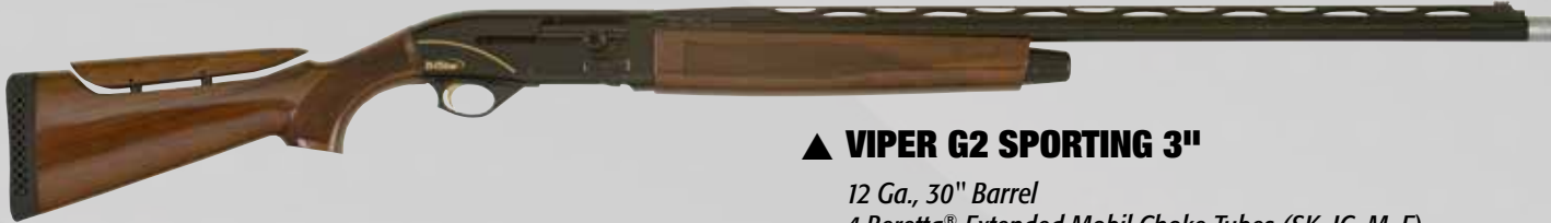
▲ VIPER G2 SPORTING 3" 12 Ga., 30" Barrel 4 Beretta® Extended Mobil Choke Tubes (SK, IC, M, F) ADJUSTABLE COMB + RAISED TARGET RIB