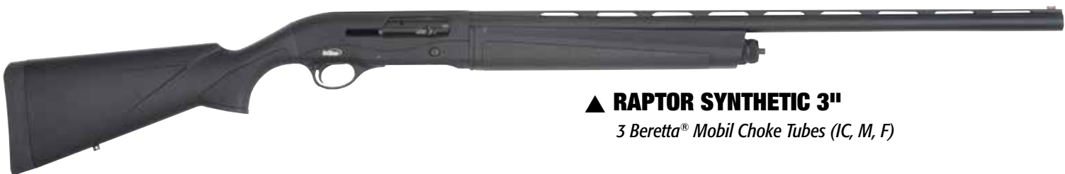
▲ RAPTOR SYNTHETIC 3" 3 Beretta® Mobil Choke Tubes (IC, M, F)