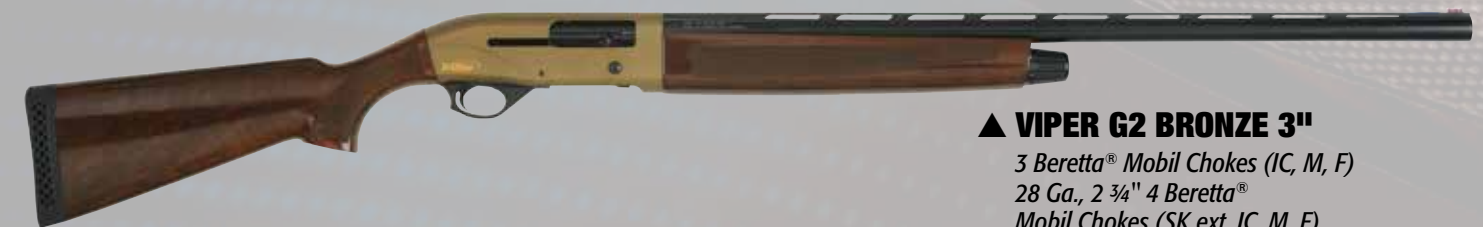
▲ VIPER G2 BRONZE 3" 3 Beretta® Mobil Chokes (IC, M, F) 28 Ga., 2 3/4" 4 Beretta® Mobil Chokes (SK ext, IC, M, F)