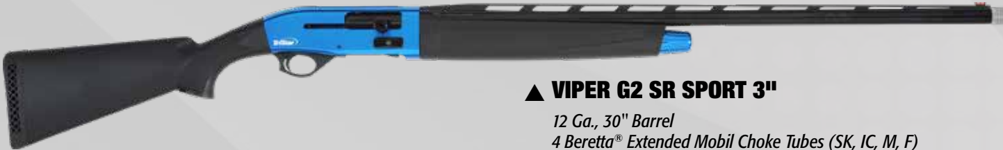
▲ VIPER G2 SR SPORT 3" 12 Ga., 30" Barrel 4 Beretta® Extended Mobil Choke Tubes (SK, IC, M, F) Anodized Receiver