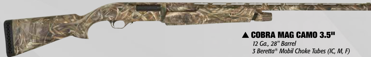
▲ COBRA MAG CAMO 3.5" 12 Ga., 28" Barrel 3 Beretta® Mobil Choke Tubes (IC, M, F) REALTREE® MAX 5

Looking for a reliable pump at an affordable price? The redesigned Cobra II Pump Hunting Line features a full length forearm, fiber optic sight and comes with 3 Chokes (IC, M, F).