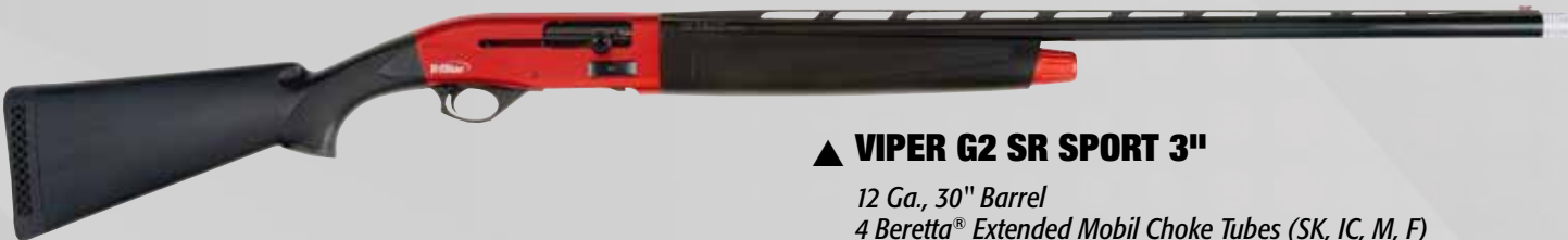
▲ VIPER G2 SR SPORT 3" 12 Ga., 30" Barrel 4 Beretta® Extended Mobil Choke Tubes (SK, IC, M, F) Anodized Receiver