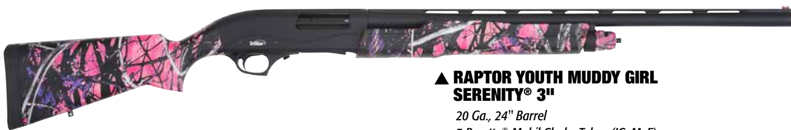
▲ RAPTOR YOUTH MUDDY GIRL SERENITY® 3" 20 Ga., 24" Barrel 3 Beretta® Mobil Choke Tubes (IC, M, F)