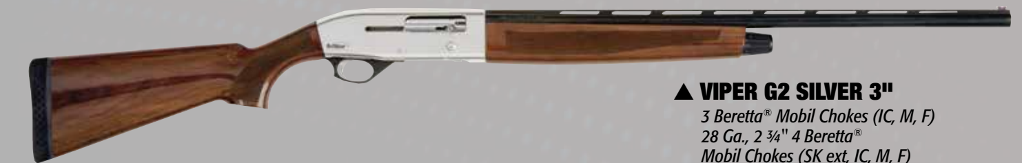
▲ VIPER G2 SILVER 3" 3 Beretta® Mobil Chokes (IC, M, F) 28 Ga., 2 3/4" 4 Beretta® Mobil Chokes (SK ext, IC, M, F)