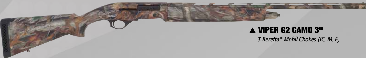
▲ VIPER G2 CAMO 3" 3 Beretta® Mobil Chokes (IC, M, F)