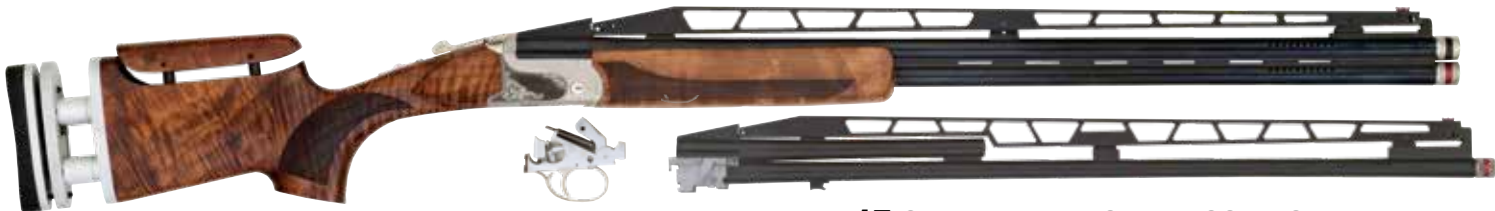
▲ TT-15 CTA DELUXE DOUBLE COMBO 12ga., 2 ¾" Chamber, 32" Barrel (Over/Under), 34" Barrel (Unsingle) 5 Beretta® Mobil Extended Color-coded Choke Tubes (SK, IC, M, IM, F)