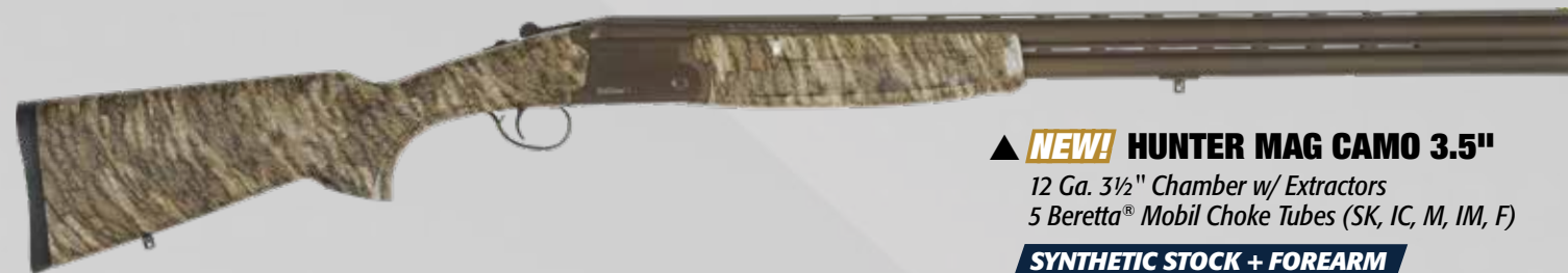
▲ NEW! HUNTER MAG CAMO 3.5" 12 Ga. 3½" Chamber w/ Extractors 5 Beretta® Mobil Choke Tubes (SK, IC, M, IM, F) SYNTHETIC STOCK + FOREARM