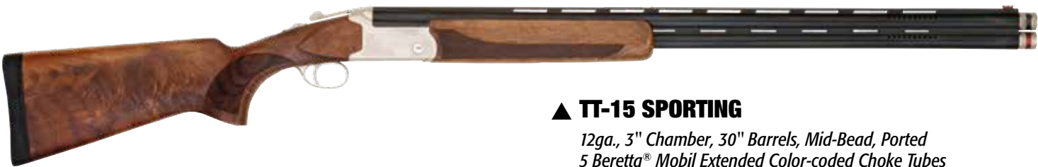
▲ TT-15 SPORTING 12ga., 3" Chamber, 30" Barrels, Mid-Bead, Ported 5 Beretta® Mobil Extended Color-coded Choke Tubes (SK, IC, M, IM, F)