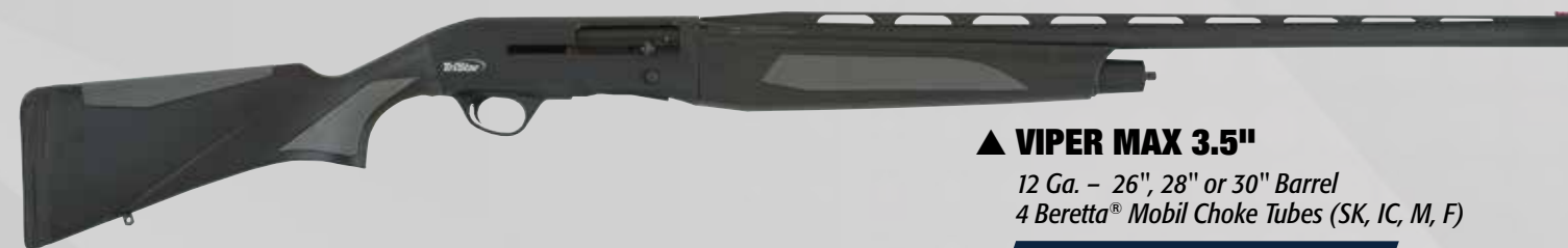
▲ VIPER MAX 3.5" 12 Ga. – 26", 28" or 30" Barrel 4 Beretta® Mobil Choke Tubes (SK, IC, M, F) OVERMOLDED RUBBER GRIPS